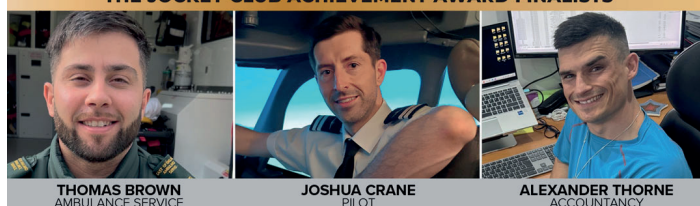
THOMAS BROWN AMBULANCE SERVICE